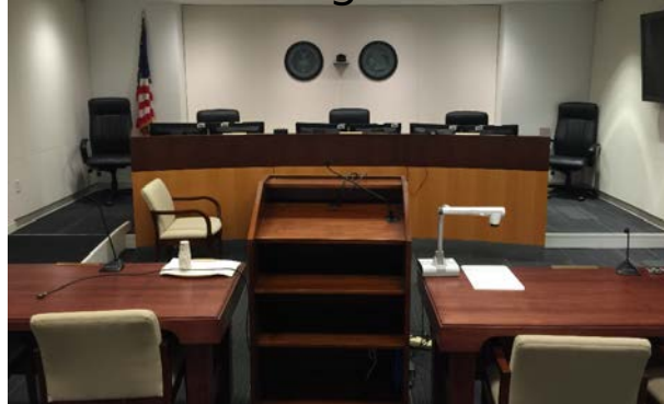
Hearing Room B