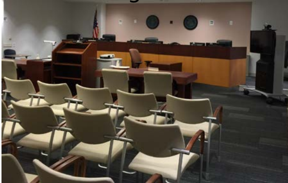
Hearing Room A